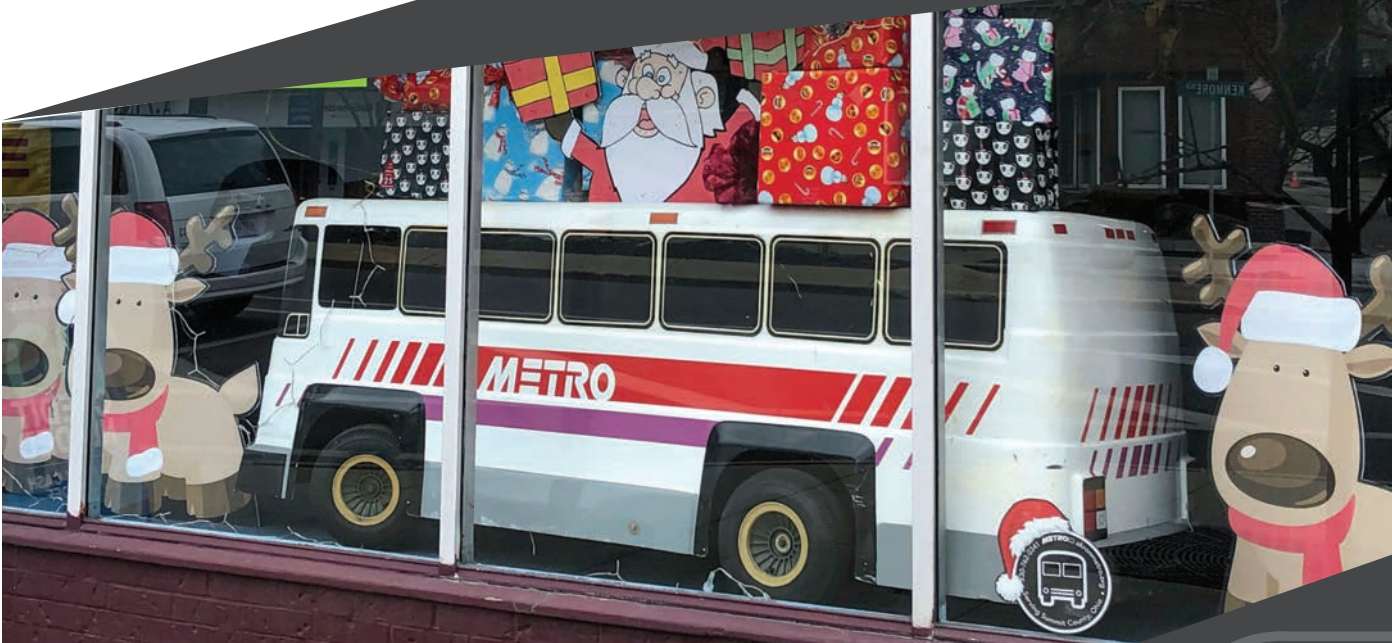
METRO decorated the storefront of Stone's Kenmore Mattress and Furniture with a special stop from Santa and his reindeer.

annual submission to the Akron Children's Hospital Virtual Holiday Tree Festival was also a show stopper. Throughout the challenges of 2020, METRO was grateful and happy to celebrate another year of successes.