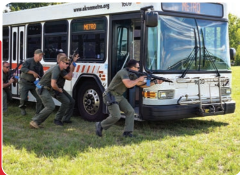
METRO works closely with the Akron Police Department (APD). In September the APD conducted training exercises on METRO buses.

Adult Protective Services Age Friendly Advisory Council Akron Blind Center Akron Metropolitan Housing Authority Akron Public Schools Akron-Summit County Public Library Akron Urban League American Public Transportation Association Black Pages of Ohio - Summit Magazine Bridges of Summit County Initiative Bridges Out of Poverty City of Akron Senior Commission RENAMED TO: City of Akron Commission on Aging CSE Credit Union Cuyahoga Valley Scenic Railroad Direction Home Advisory Council Department of Jobs and Family Services Downtown Akron Partnership Elevate Greater Akron Full Term First Birthday Community Action Team Goodwill Industries of Akron Greater Akron Chamber