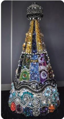
METRO partnered with ACCESS Inc. to create this holiday tree, titled "Bling on the Holidays," made from repurposed jewelry and bus advertising signs.

annual submission to the Akron Children's Hospital Virtual Holiday Tree Festival was also a show stopper. Throughout the challenges of 2020, METRO was grateful and happy to celebrate another year of successes.